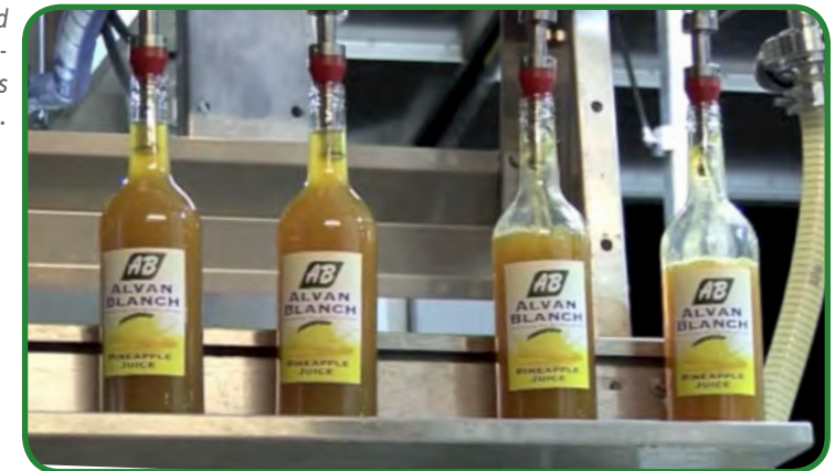
▶ Pasteurised juice being hot-filled into glass bottles.