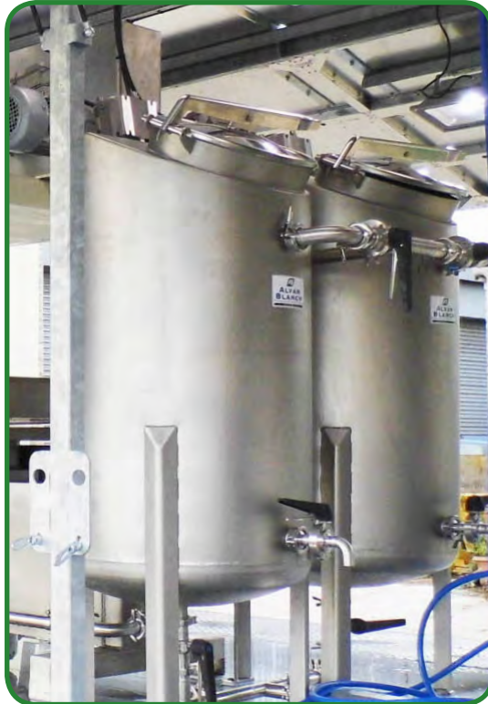
▲ The mixing tanks - juice collection taken after pressing