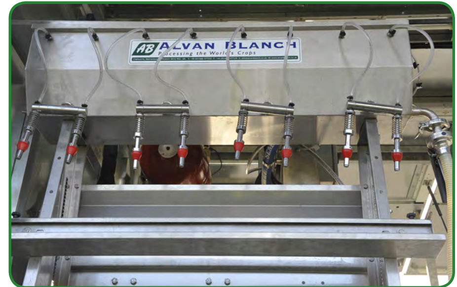
▼ Eight head bottling system with manual flow control